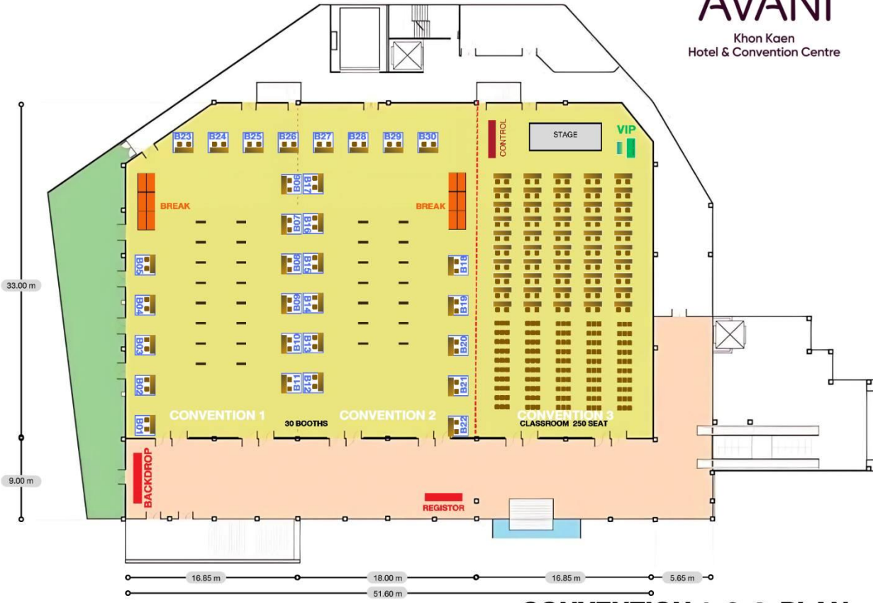
CONVENTION 1-2-3 PLAN

AVANI Khon Kaen Hotel & Convention Centre